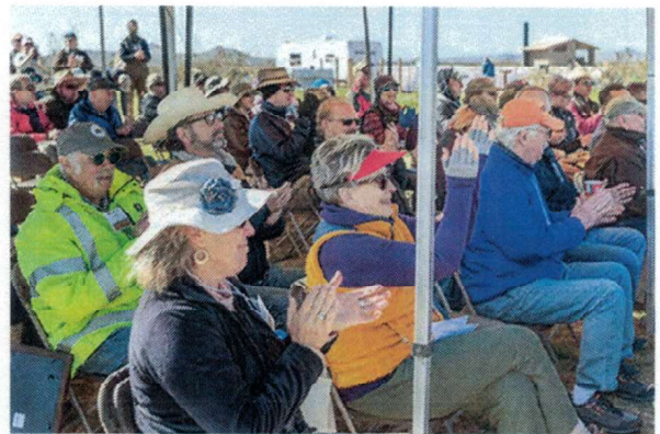
▲ Guests welcome one of the presenters at the event.