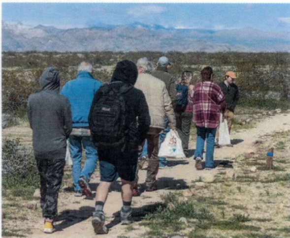
▲ Guests enjoying a walk on a DTRNA nature trail.